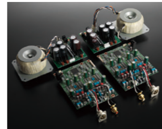
Left and right DAC circuit boards, and individual power supply units

The N-01XD SE's mighty power supply is the key to its powerful and profound three-dimensional sound. The N-01XD SE features a total of four independent toroidal power transformers, one each for the right and left channel DACs, digital circuits, and network module. Furthermore, technologies cultivated in the development of the Grandioso P1X/D1X have also been adopted, including a low-feedback DC power supply regulator featuring a discrete circuit configuration which contributes to its powerful open sound.