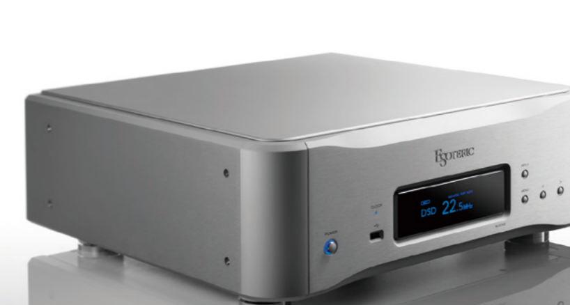
Network DAC N-01XD SE

The SE model we are releasing this time reflects every conceivable technological accumulation from the time the original model was launched to the present. Enjoy the enhanced presence, dynamics, and beautifully organic and musical textures of the new SE model.