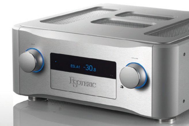
Class A Integrated Amplifier F-01 (30W+30W/8Ω)